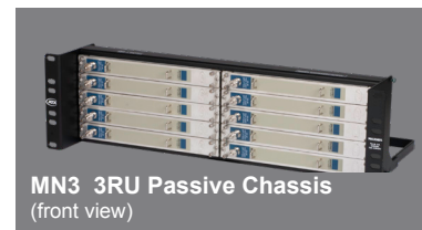
MN3 3RU Passive Chassis (front view)