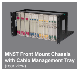
MN5T Front Mount Chassis with Cable Management Tray (rear view)