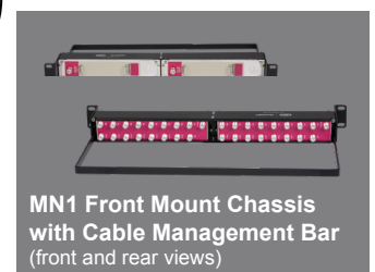
MN1 Front Mount Chassis with Cable Management Bar (front and rear views)

MAXNET® is a registered trademark of ATX in the United States and/or other countries. Products or features contained herein may be covered by one or more U.S. or foreign patents. Other non-ATX product and company names mentioned in this data sheet are the property of their respective companies.