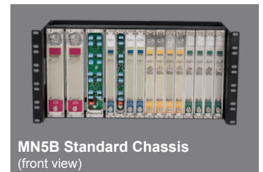
MN5B Standard Chassis (front view)