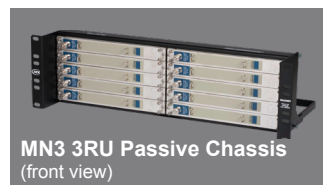
MN3 3RU Passive Chassis (front view)