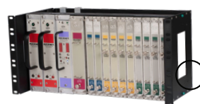
MN5BA Active Chassis (front view)