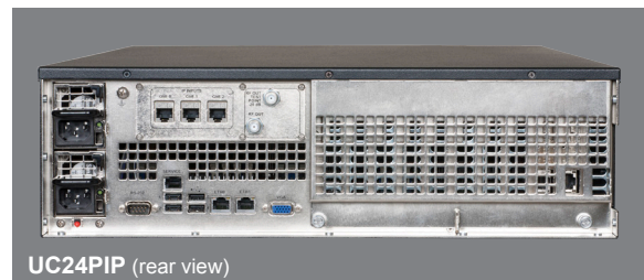
UC24PIP (rear view)