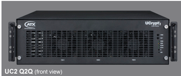
UC2 Q2Q (front view)