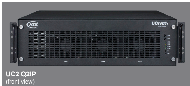
UC2 Q2IP (front view)