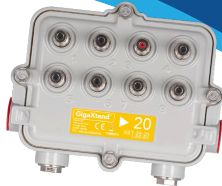
XST-28-20 (front view)

The GigaXtend™ family of Taps and Line Passives injects immediate cost and performance benefits into existing HFC networks, as well as positions cable operators to seamlessly extend the bandwidth capabilities of their HFC networks to 2GHz and beyond.