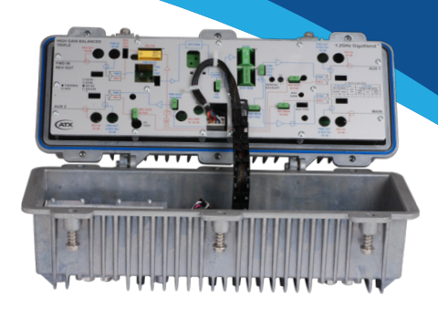
GMC 1.2GHz High Gain Balanced Triple (HGBT) System Amplifiers (front view)

GMC 1.2GHz (GainMaker® Compatible) High Gain Balanced Triple (HGBT) System Amplifier