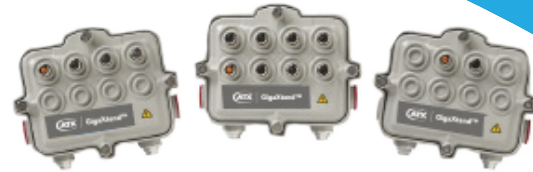
SGDT 1.2GHz Drop Power Taps (front view)