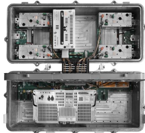
OM6000 with 1x1 RPD Module

The Remote PHY Device (RPD) is a key component in CommScope's Distributed Access Architecture (DAA) portfolio, which can provide significant operational benefits—including increased bandwidth capacity, improved fiber efficiencies (wavelengths and distance), simplified plant operations with digital optics, and decreased loads on facility space and power systems—by extending the digital portion of the headend or hub to the node and placing the digital/RF interface at the optical/coax boundary. The RPD works in conjunction with the CCAP Core to extend the PHY layer from the CCAP into an Opti Max™ OM6000™ fiber deep node. MAC processing, provisioning, and monitoring functions remain in the headend. The RPD provides full spectrum support for digital broadcast TV, VoD, and DOCSIS 3.0 and DOCSIS 3.1, as well as strategic alignment with future NFV/SDN/FTTx systems.