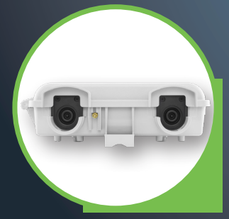
Large Rubber Grommets Entry for up to 1 inch Conduit